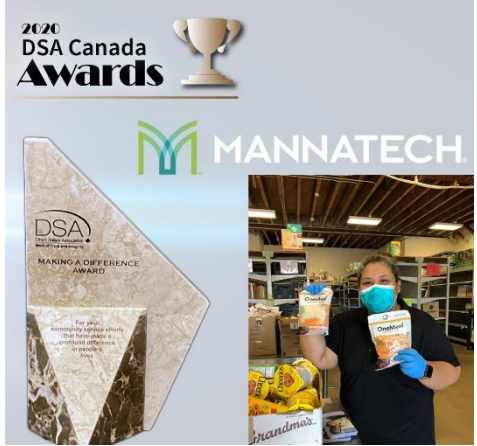
Mannatech - Nourishing Hope Campaign, 2020 Recipient.

Please complete the Nomination Form and submit with supporting materials (enclose any photos, printed materials, publicity, programme presentations, videos, testimonials, or anything else that helps tell your company's story) no later than November 8, 2021 to <u>tara@dsa.ca.</u>